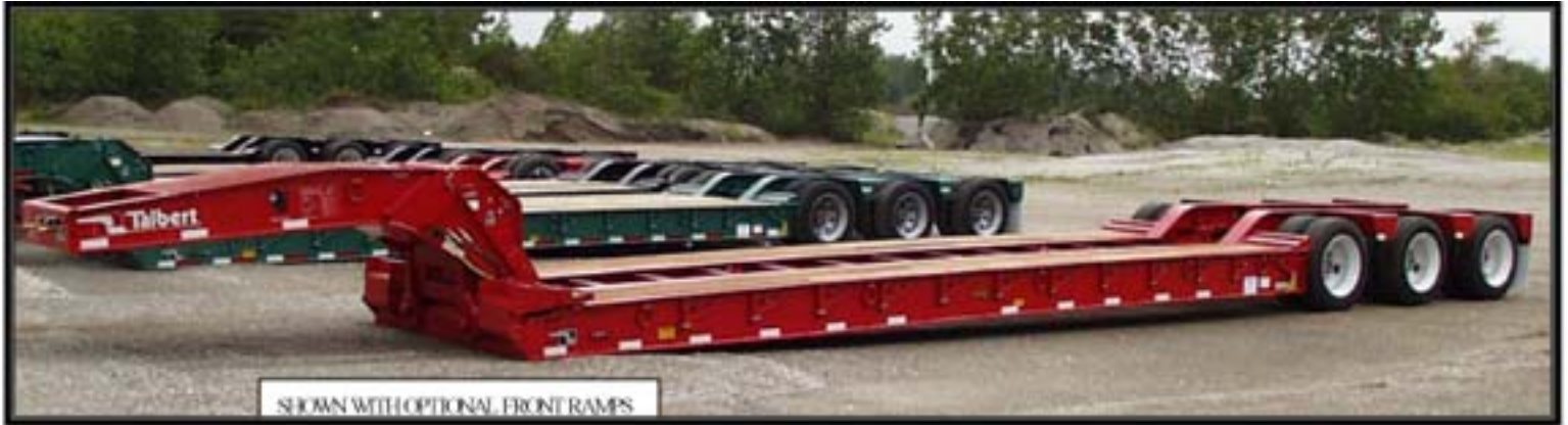
SHOWN WITH OPTIONAL FRONT RAMPS