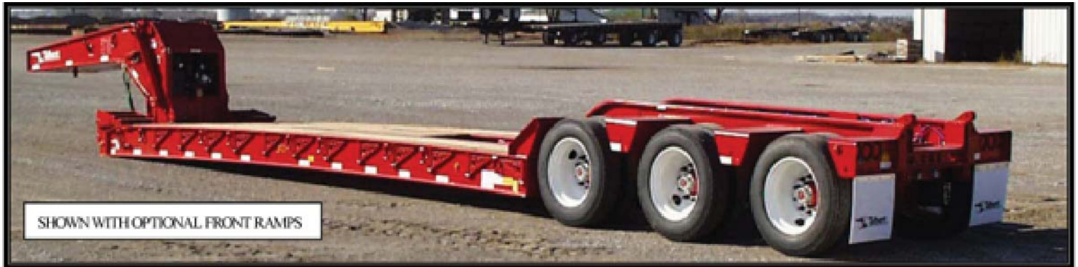
SHOWN WITH OPTIONAL FRONT RAMP